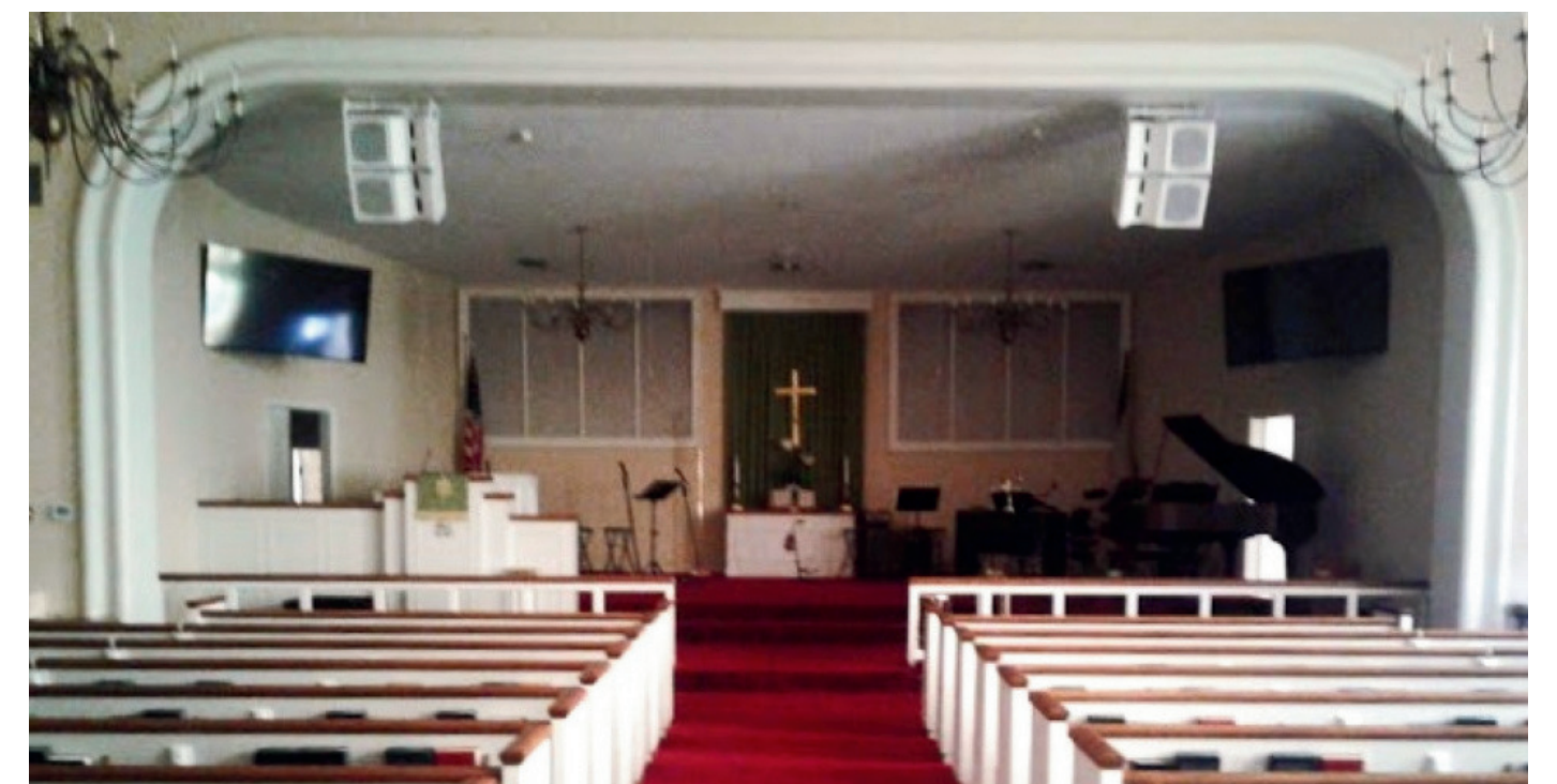
When rebuilding after the 1957 fire, the sanctuary was changed to face east instead of north.