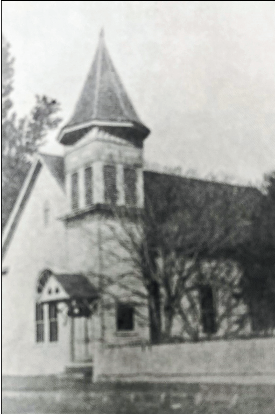
This is the 1877 church on North Main St., circa 1910. The congregation moved to the current church building in 1917. Subsequently, the First Christian Church occupied it for eight years before it was torn down.