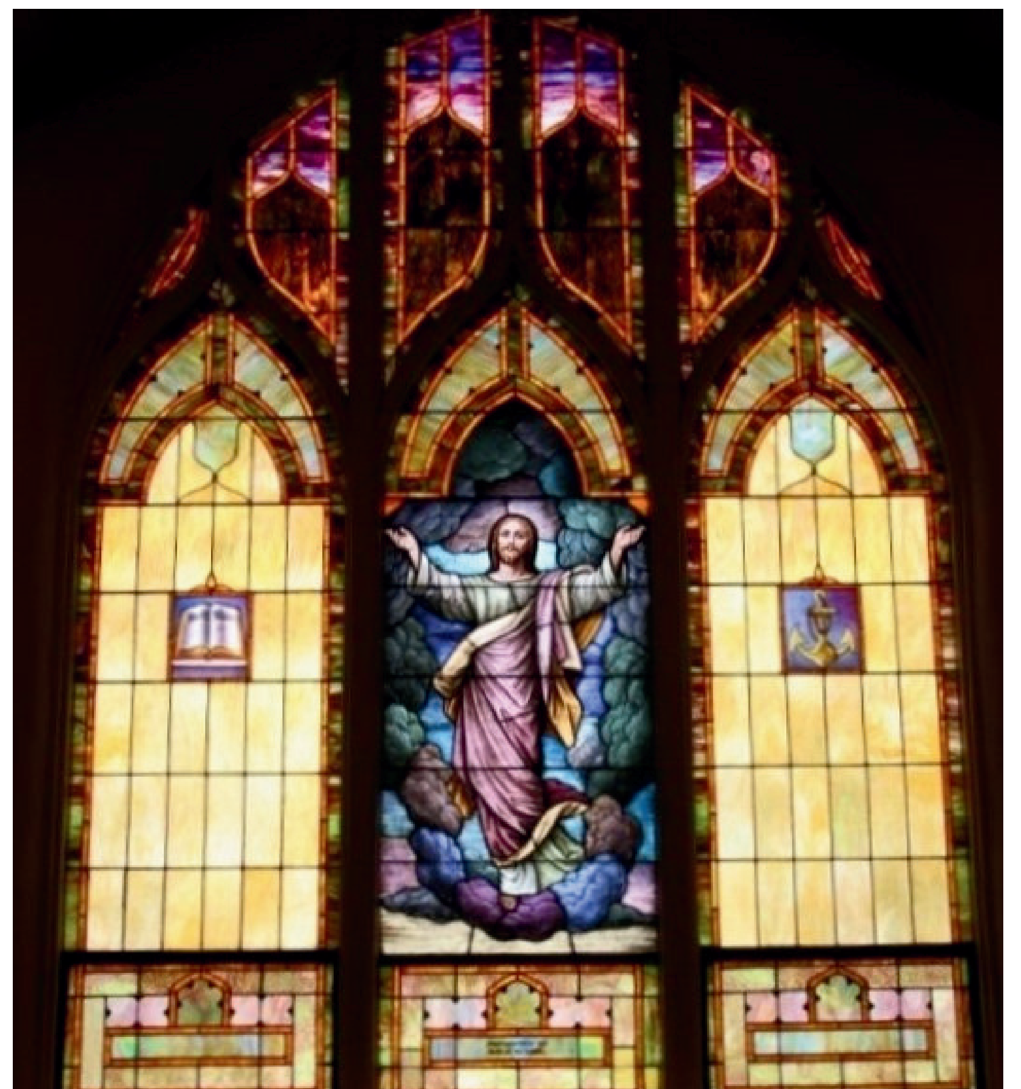
The Bible School presented this window, titled Christ is Risen , to the church in 1925. It is one of six beautiful windows surrounding the sanctuary.